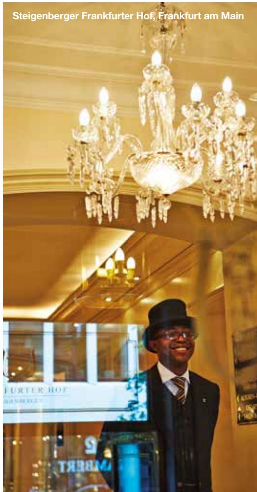
Steigenberger Frankfurter Hof, Frankfurt am Main