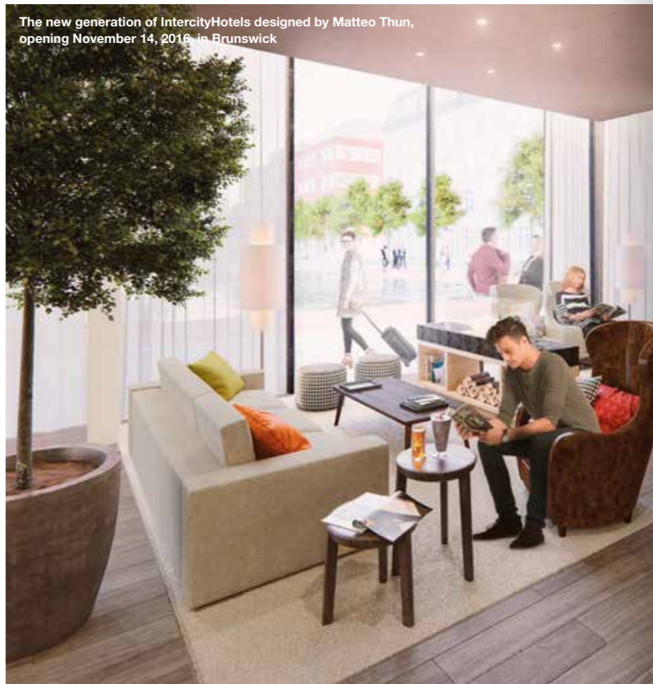
The new generation of InterCityHotels designed by Matteo Thun, opening November 14, 2016, in Brunswick