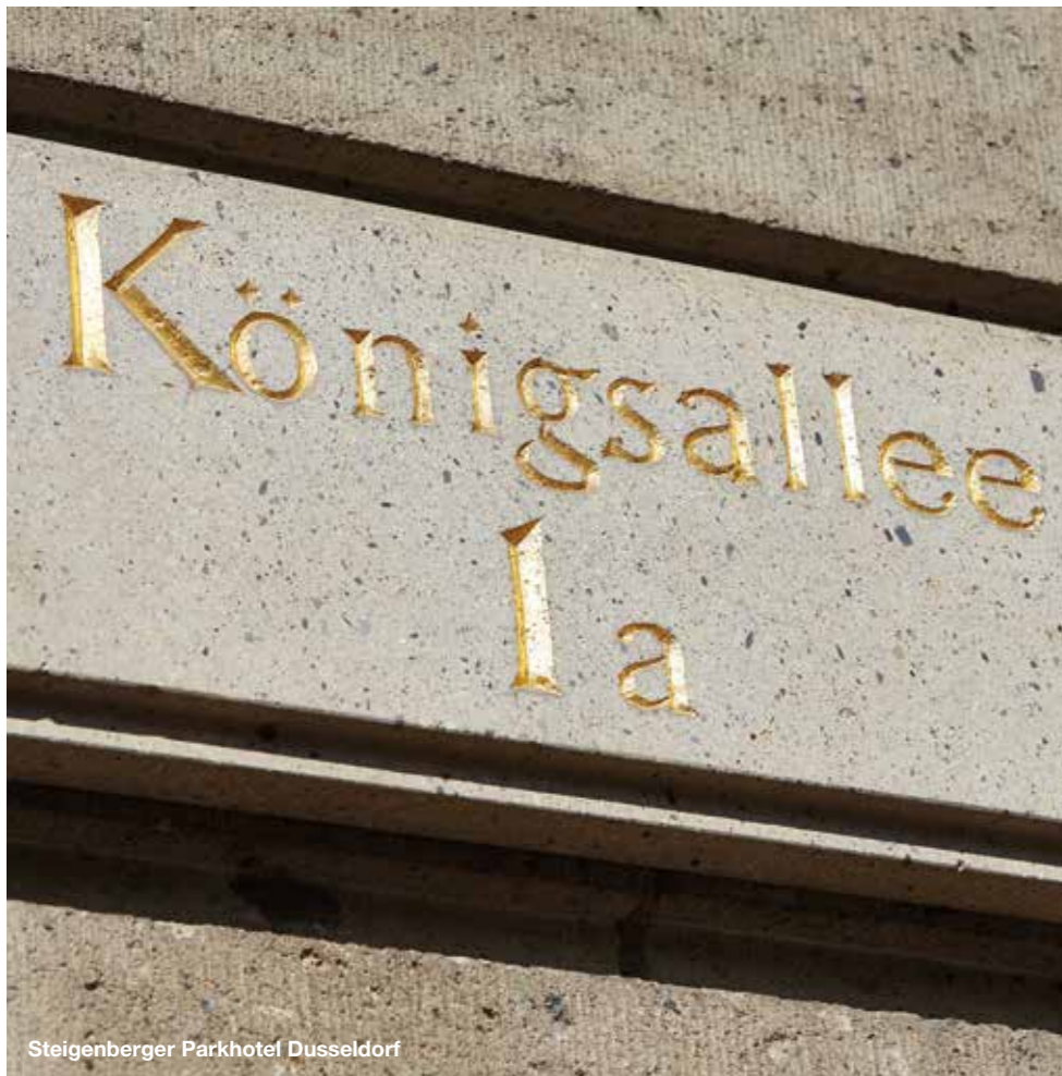
Steigenberger Parkhotel Dusseldorf