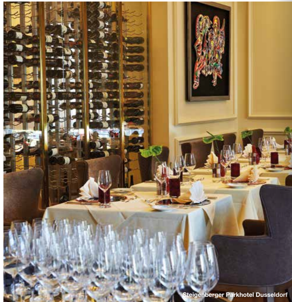
Steigenberger Parkhotel Dusseldorf

“Deutsche Hospitality is an excellent employer. The mix of German quality and international flair is simply fantastic.”