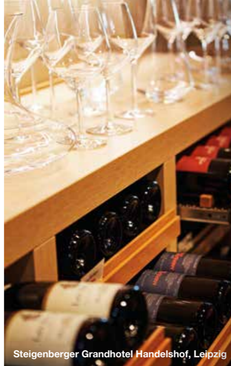
Steigenberger Grandhotel Handelshof, Leipzig