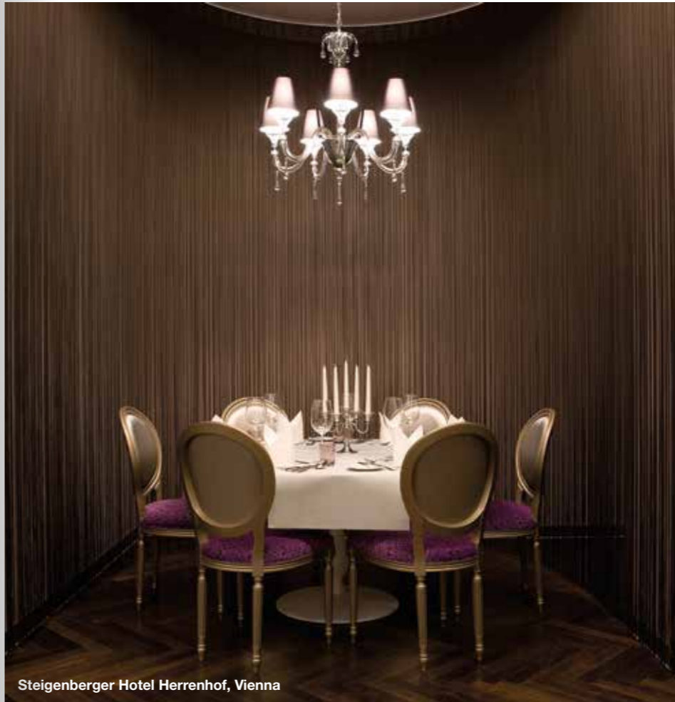
Steigenberger Hotel Herrenhof, Vienna