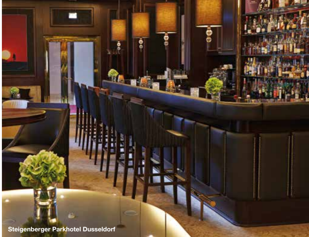
Steigenberger Parkhotel Dusseldorf