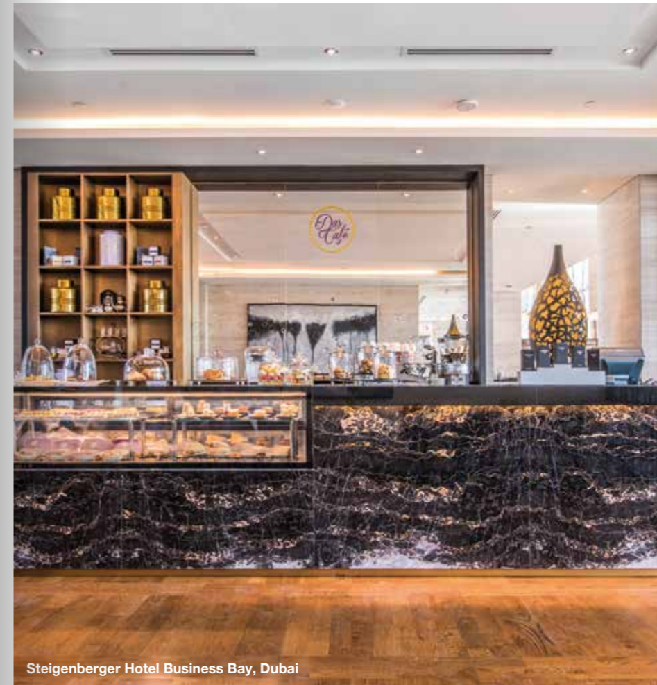
Steigenberger Hotel Business Bay, Dubai