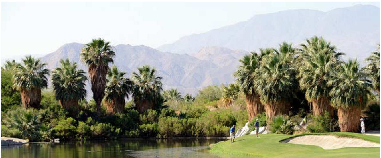
Golfing in Palm Springs

The City of Palm Springs became a popular resort in the early 1920s with the arrival of Hollywood film stars who flocked to the area for sunny weather and seclusion. This era also saw the establishment of glamorous luxury resorts catering to celebrities and the well-to-do. Increasing numbers of retirees have arrived over the decades, and the city has also long been a popular spring break destination. Over the years, the destination area has expanded south and west. The greater Coachella Valley now boasts several independent leisure and group resorts, including the Ritz-Carlton Rancho Mirage, Omni Las Palmas, and La Quinta Waldorf Astoria, as well as branded limited-service hotels. Today, the area is known for its boutique hotels, mid-century modern architecture, and annual festivals, including the two-week Coachella Music Festival in April.