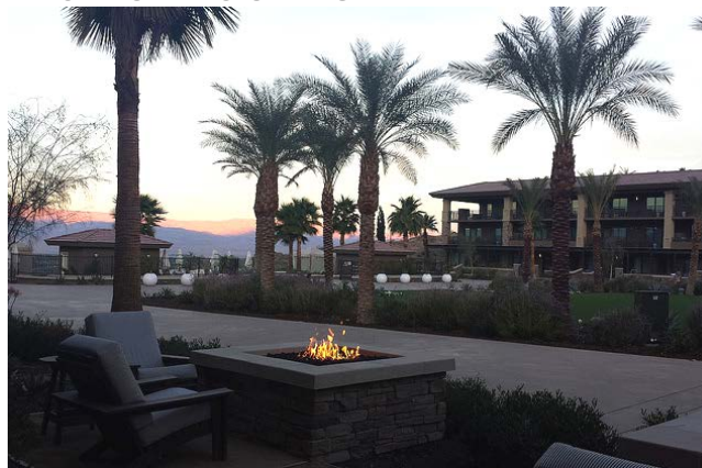
RITZ-CARLTON RANCHO MIRAGE