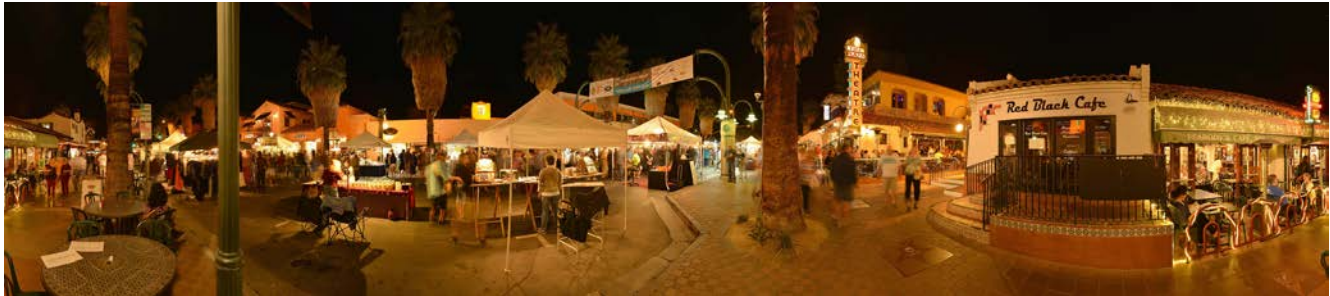
Palm Springs VillageFest

As the heart of the resort area, downtown Palm Springs is a walkable, urban center, with plentiful shopping and dining options and a variety of restaurants and retail boutiques. Downtown is also a cultural and entertainment hub, featuring theatres, museums, and the Agua Caliente Band of Cahuilla Indians Spa Casino. Downtown is also home to the Palm Springs VillageFest, a Thursday night street fair featuring arts, crafts, food, and entertainment, attracting numerous visitors. The Palm Springs Convention Center and various hotels also contribute to the vibrancy of the downtown scene. Rounding out the downtown landscape is the historic O'Donnell Golf Course situated on the northwest side, the Historic Tennis Club Neighborhood on the south end, and the majestic San Jacinto Mountains as its backdrop.